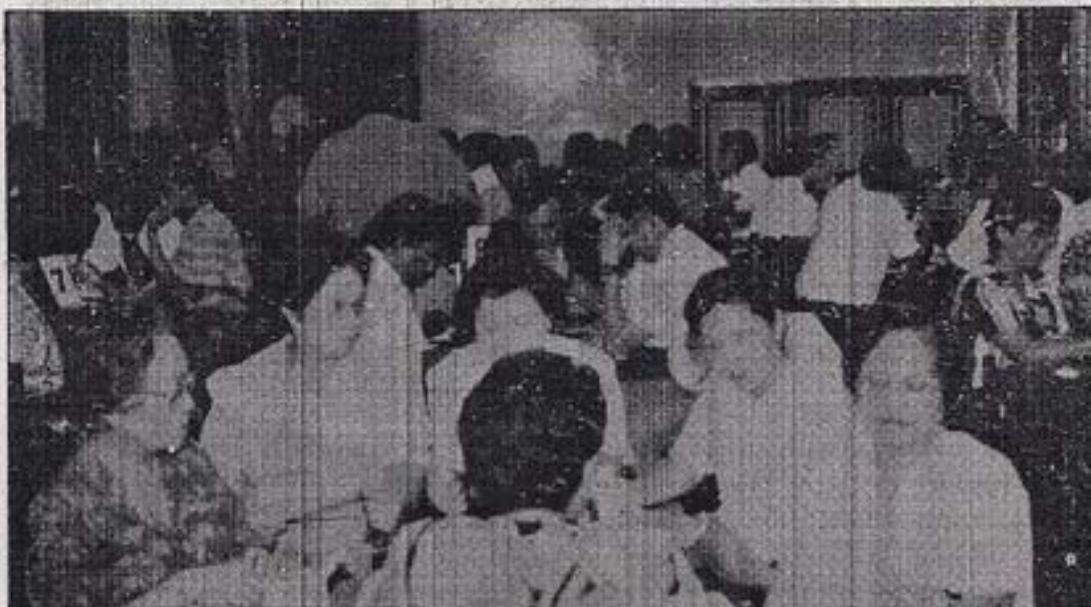
Cagayan de Oro CLP 1 discussion groups are intently sharing on their relationship with God.