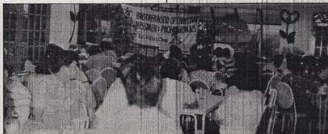
Las Piñas breakfast goers listen intently to their sharer.

I praise and thank the God-Child and the BCBP mission team for giving me this most beautiful and meaningful Christmas gift.