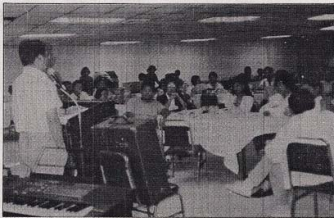
Alabang and Las Pinas CLP participants seek to more clearly understand God's will for them.