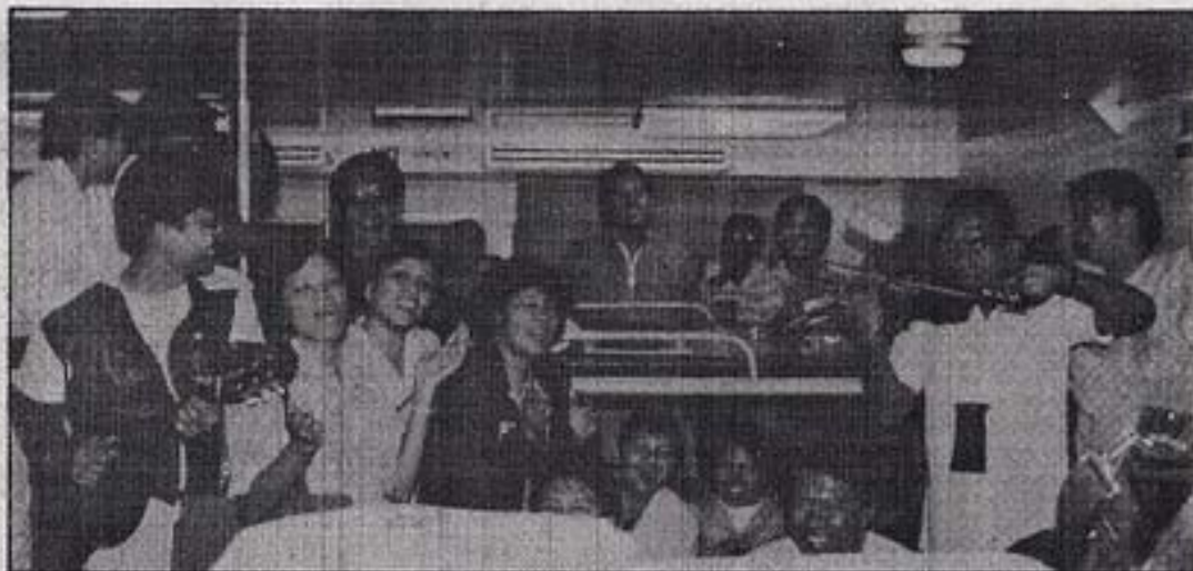
On board the Asta-Japan boat on their way to Cagayan de Oro the Cebu BCBPers enjoy lively fellowship.