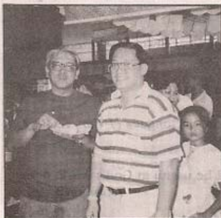
A day full of fellowship, fun, bargains and of course, FOOD!