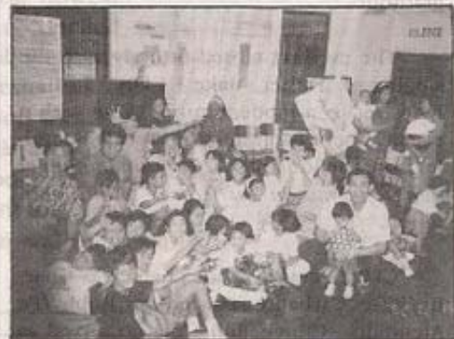
The Christmas spirit is high during the gift giving time at the Orphanage.