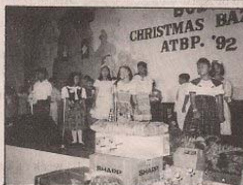
More BCBP Bazaar pictures on p. 12 and 13.

BCBP SECRETARIAT ADDRESS: Palm Bldg., 4033 Yague St. Makati. T-813-0970, 880-809