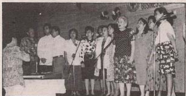
The Alabang Choir puts their hearts into the song as they serenade during the Christmas breakfast of the chapter.