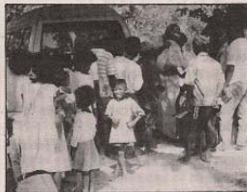
The Las Pinas brothers and sister mingle with the Mt. Pinatubo evacuees