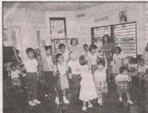
The children at St. Rita's Orphanage respond to the Children's Formation caroling with their rendition of Christmas songs.

The Children's Formation would like to take this opportunity to thank everyone for generously supporting their activities.