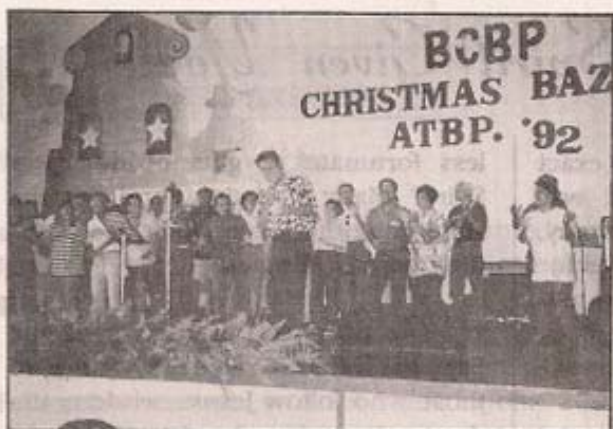
The name of the game is B-I-N-G-O