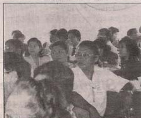
RFM breakfast goers listen intently to the sharers.