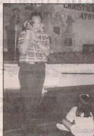
Look who's on candid camera?